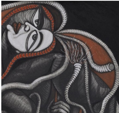
1 Worlds" on the ASU Downtown